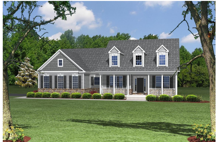
ELEVATION D2 SHOWN W. OPTIONAL SIDE LOAD