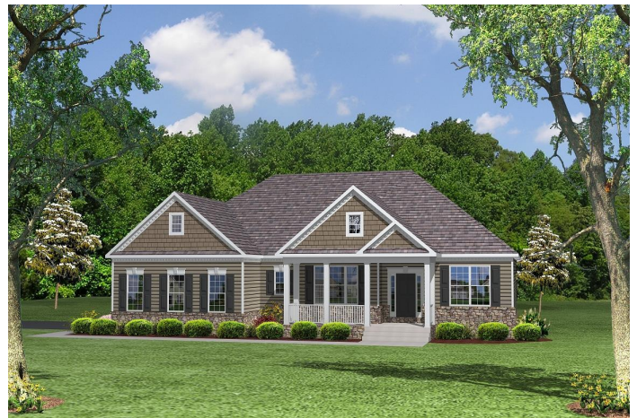
ELEVATION D1 SHOWN W. OPTIONAL SIDE LOAD