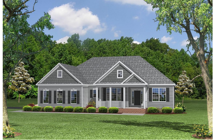
ELEVATION A1 SHOWN W. OPTIONAL SIDE LOAD