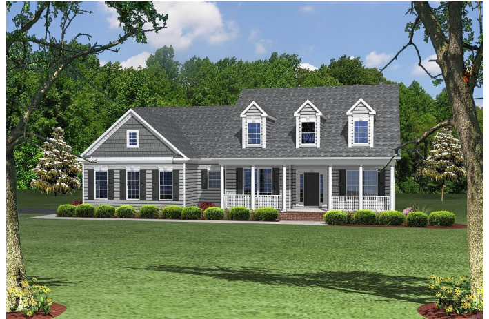
ELEVATION A2 SHOWN W. OPTIONAL SIDE LOAD