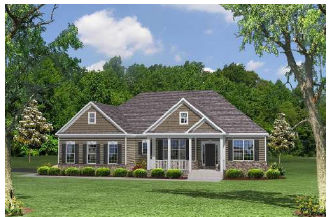
ELEVATION D1 SHOWN W. OPTIONAL SIDE LOAD