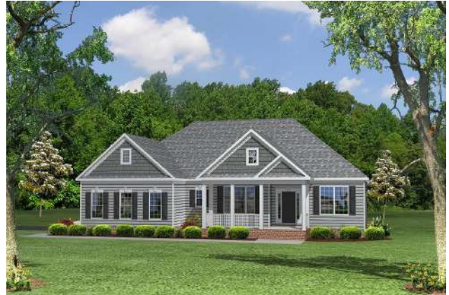
ELEVATION A1 SHOWN W. OPTIONAL SIDE LOAD