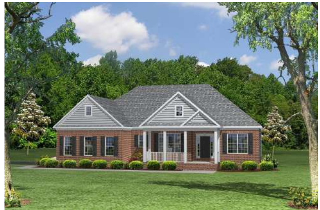
ELEVATION B1 SHOWN W. OPTIONAL SIDE LOAD