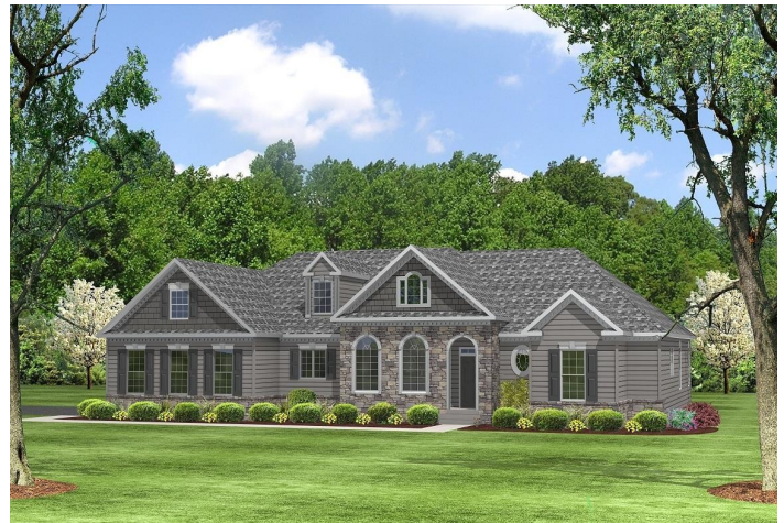
ELEVATION D2 SHOWN W. OPTIONAL SIDE LOAD