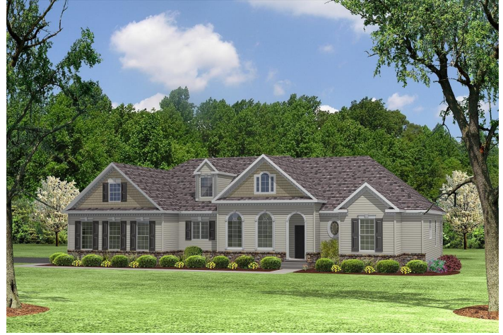
ELEVATION D1 SHOWN W. OPTIONAL SIDE LOAD